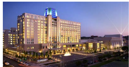
Renaissance Hotel and Convention Center 201 Tallapoosa Street | Montgomery, AL 36104 Reservations 334-481-5000