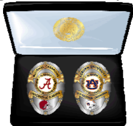
(Fig 2) Box Only

We regret we cannot offer a triple badge display box, however; Hobby Lobby or similar stores have a good selection of display boxes.