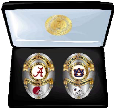
(Fig 3) Box Only

Mail this form, along with payment and letter of request from Agency Head to: